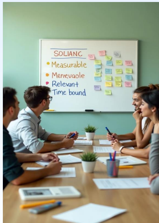
Structured approach to achieving accreditation success